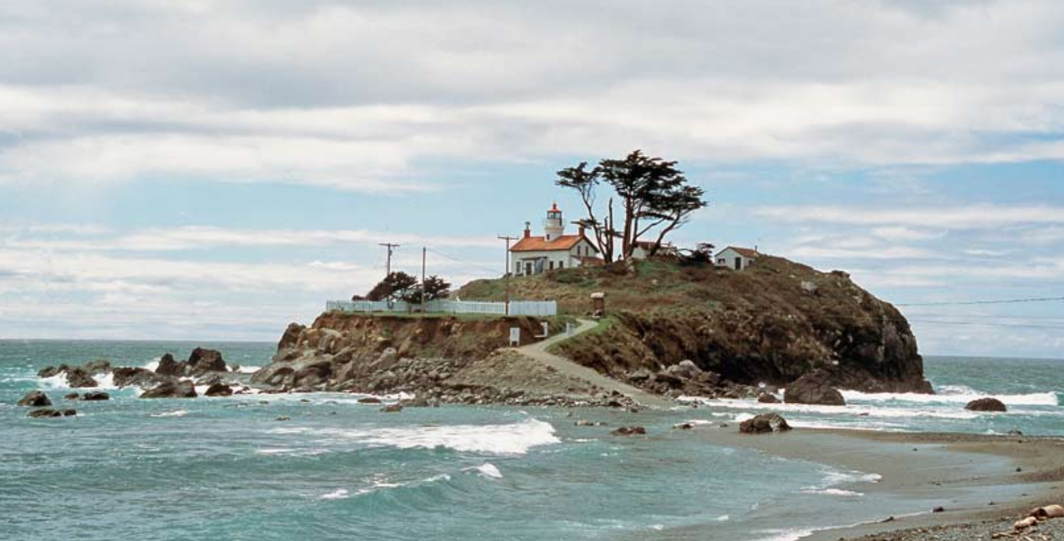
Battery Point Lighthouse in Crescent City.