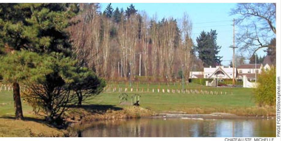
CHATEAU STE. MICHELLE