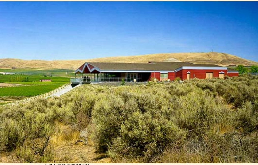
KIONA VINEYARDS WINERY

PETE ECKERT, YOST GRUBE HALL ARCHITECTURE